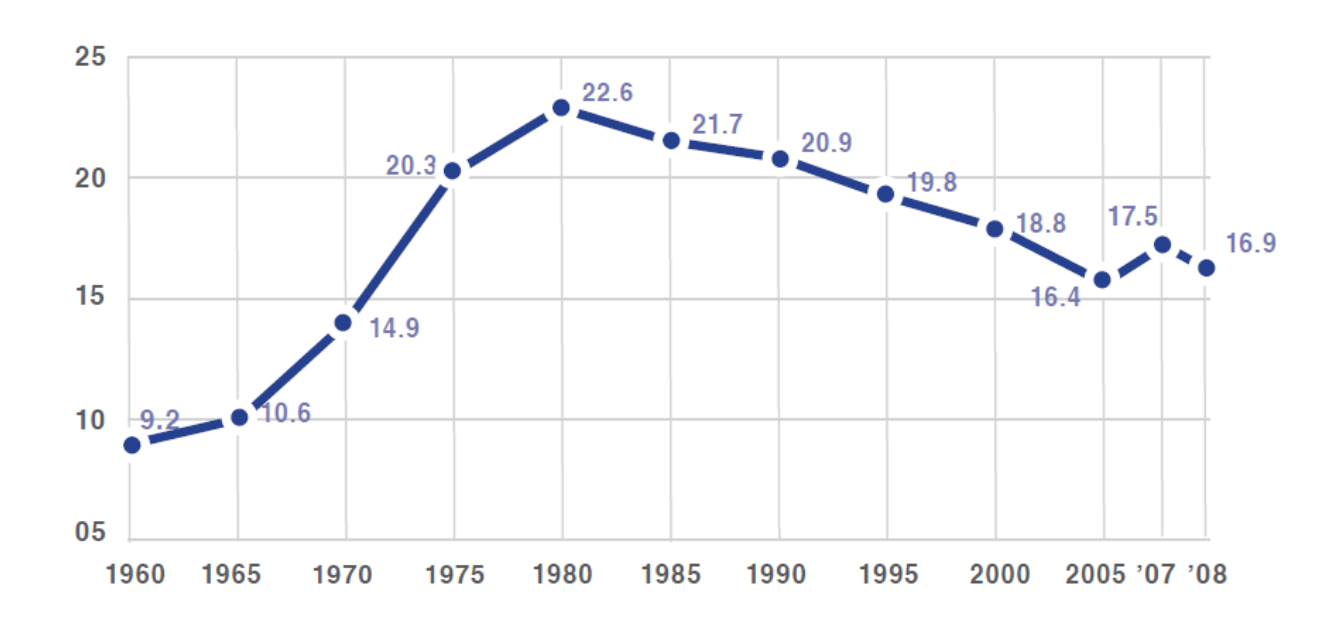
Figure 1: Number of Divorces per 1,000 Married Women Age 15 and Older, by Year, United States